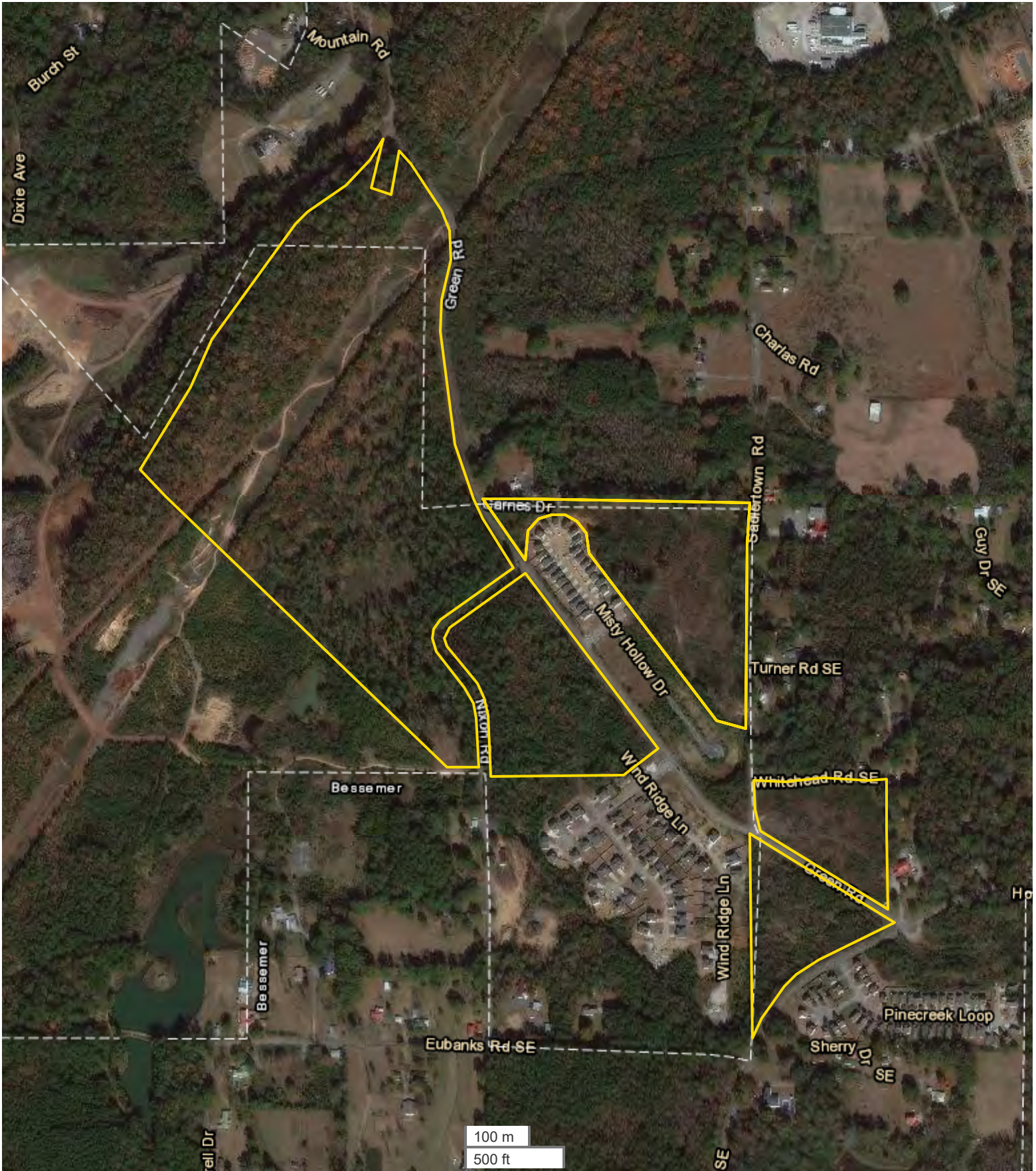
All boundary lines noted in pictures, aeriels or maps should be considered estimates and not relied on as legal documents or descriptions.