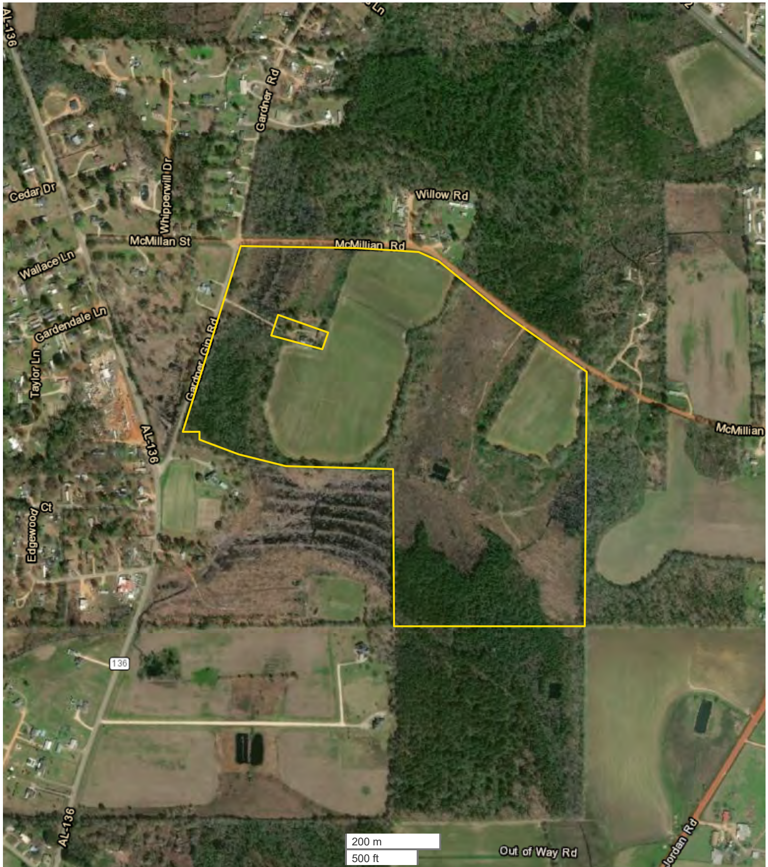
All boundary lines noted in pictures, aeriels or maps should be considered estimates and not relied on as legal documents or descriptions.