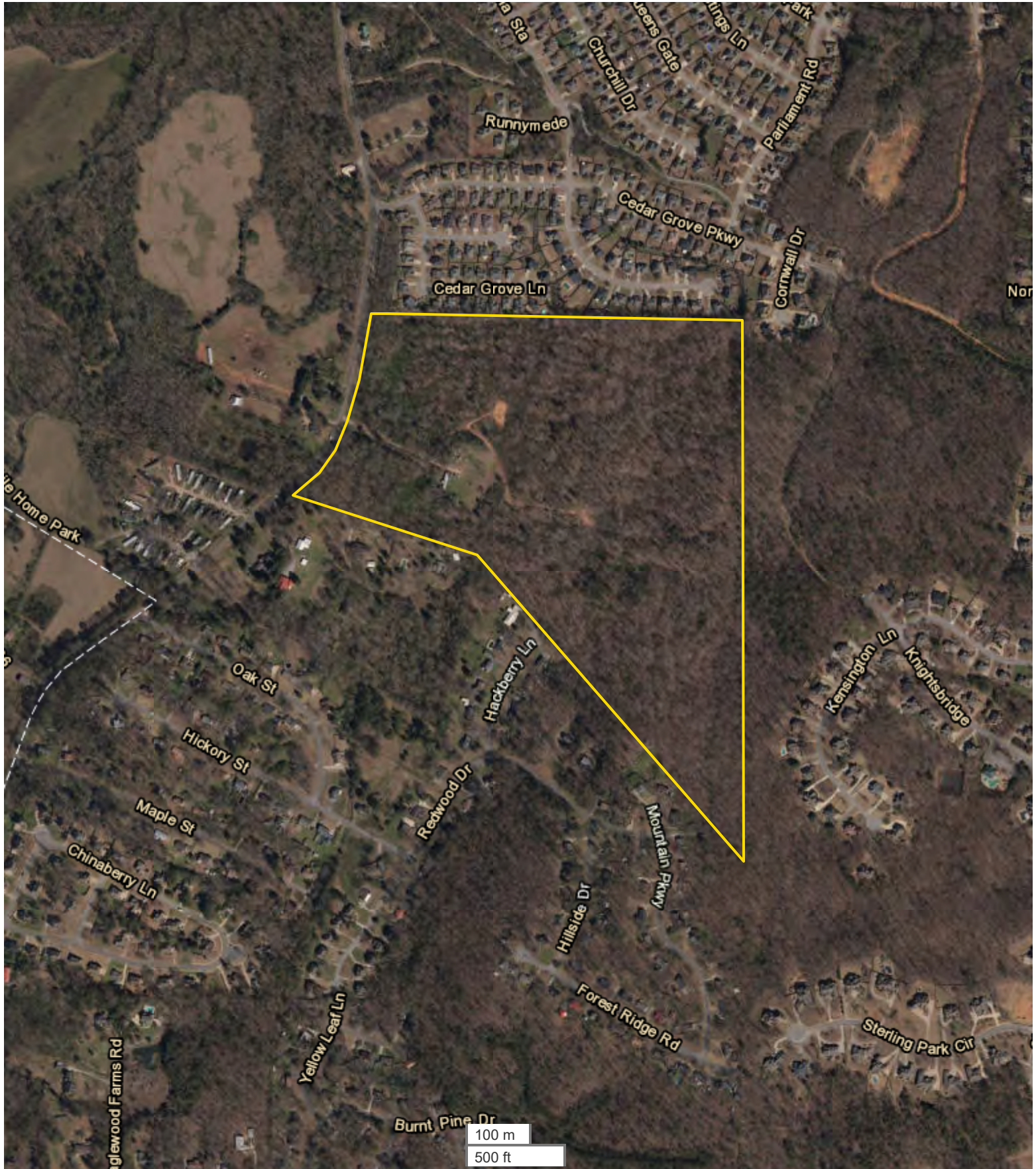
All boundary lines noted in pictures, aeriels or maps should be considered estimates and not relied on as legal documents or descriptions.