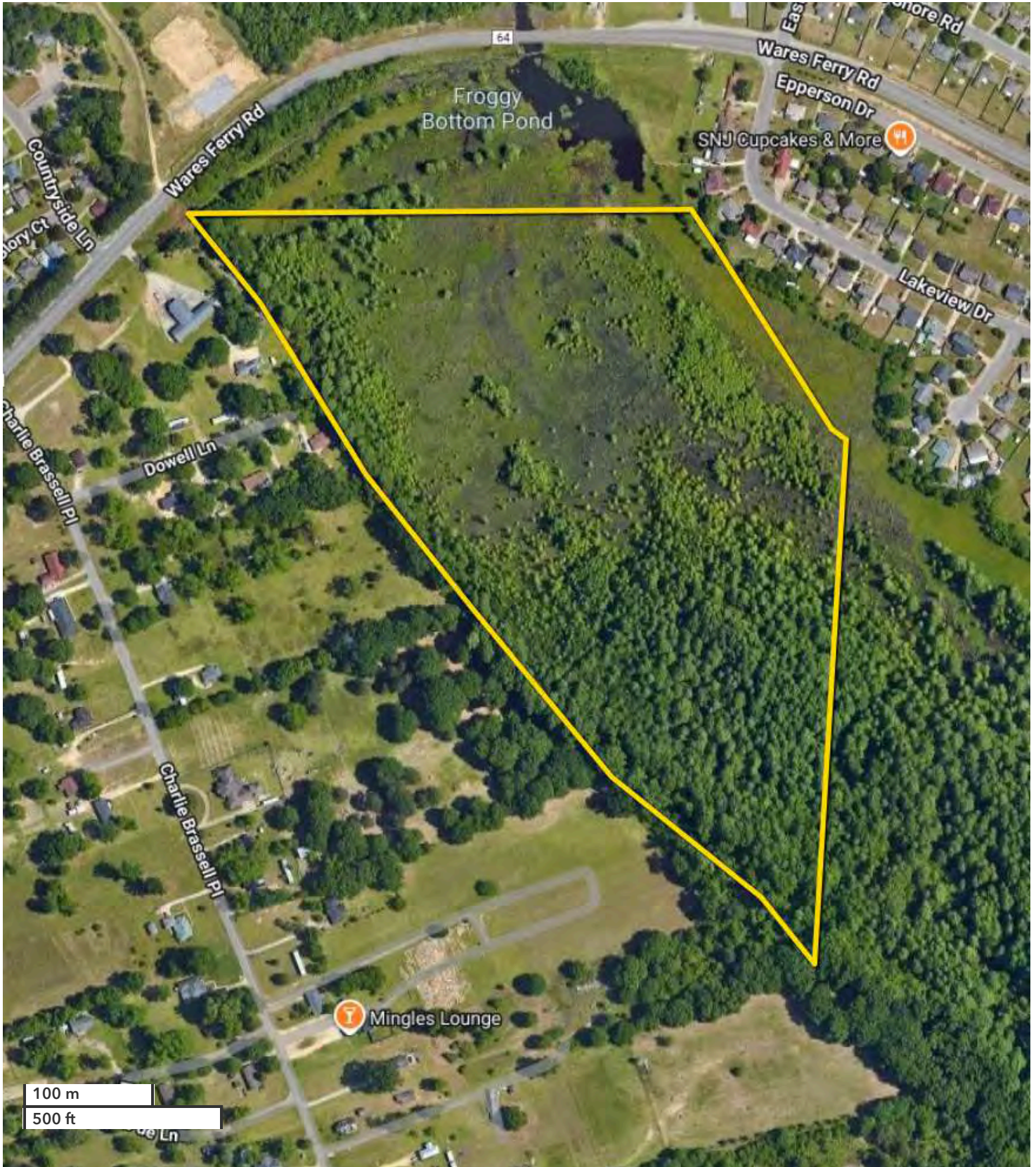
All boundary lines noted in pictures, aerials or maps should be considered estimates and not relied on as legal documents or descriptions.