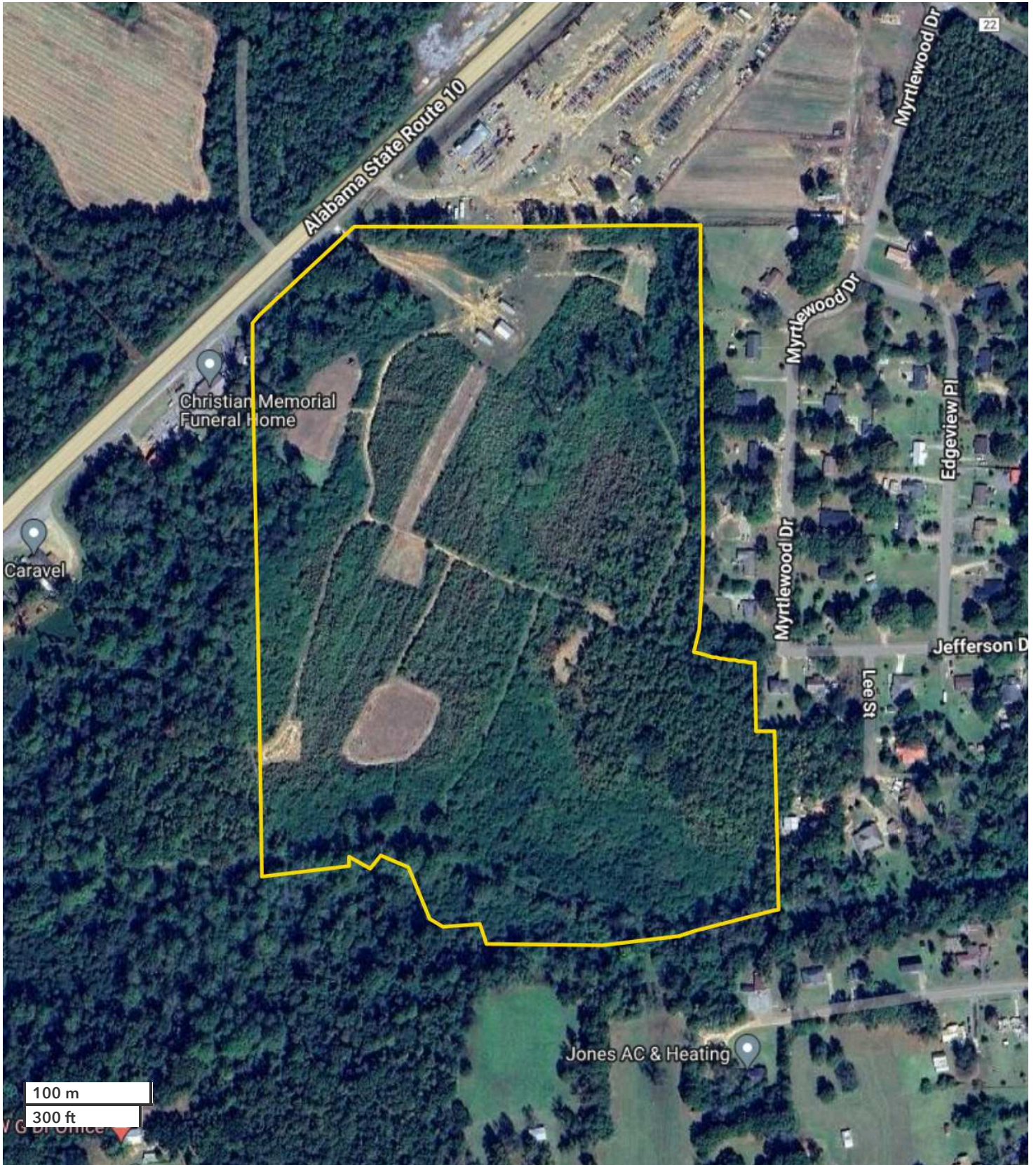
All boundary lines noted in pictures, aerials or maps should be considered estimates and not relied on as legal documents or descriptions.