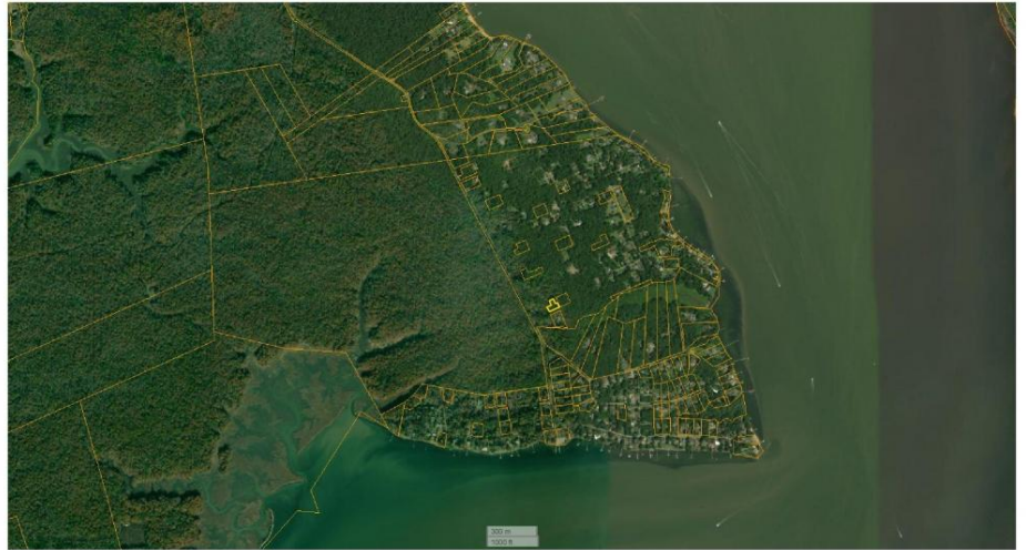
All boundary lines noted in pictures, aerials or maps should be considered estimates and not relied on as legal documents or descriptions.

Mallow/Nicotine Trail, Lorton, VA 22079 County, VA <1 Acre $21,000